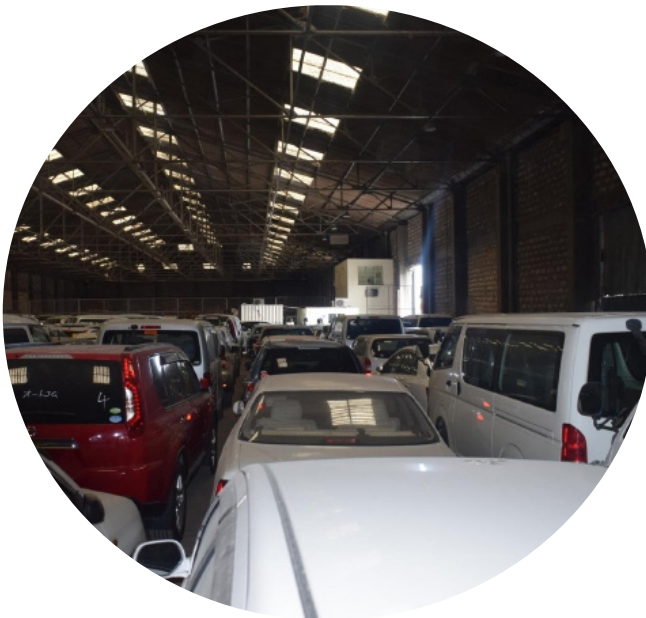
Motor Vehicle Handling