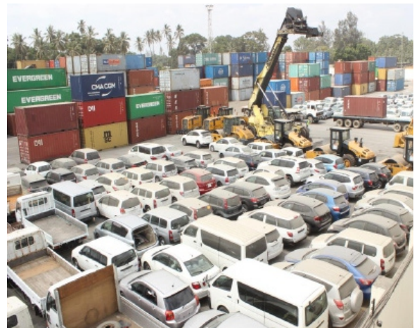
Open Yard Storage